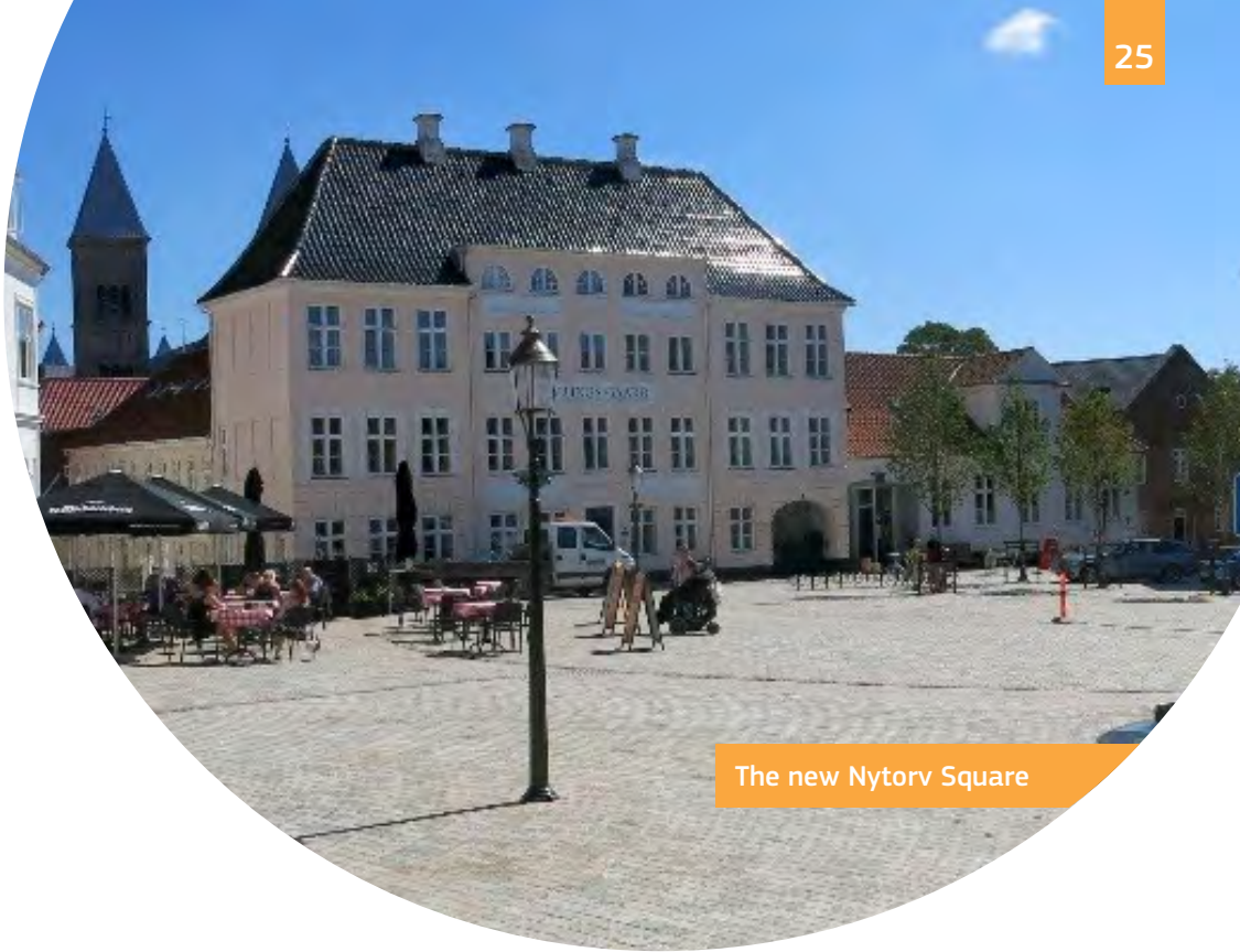
The new Nytorv Square

In the historic city, several public squares, gardens and streets have been made accessible with new level pavements, ramps and tactile guide strips. The Nytorv Square is a new fully accessible public area that has been created from an old car park.