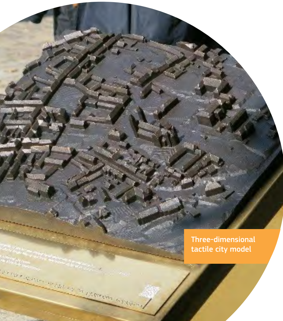
Three-dimensional tactile city model

A Disability Policy was adopted by the City in 2009. It was based on feedback from workshops and meetings with local citizens, organisations of people with disabilities and older people and major city centre stakeholders. The policy includes a checklist for accessibility covering public places and buildings with recommendations for action.