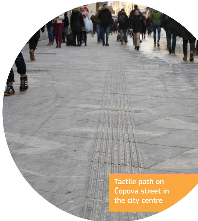
Tactile path on Čopova street in the city centre

A city map of accessible locations is available.