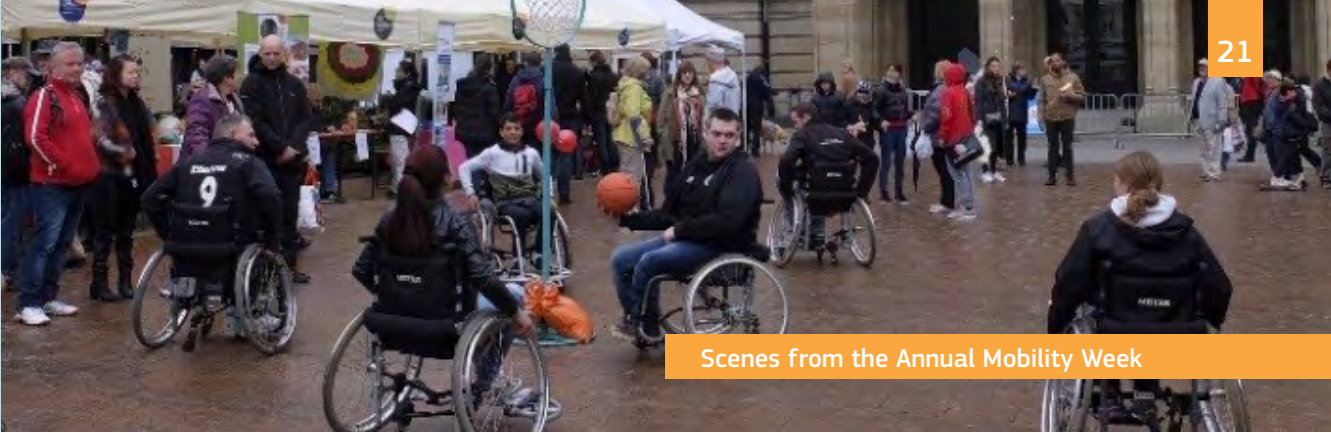
Scenes from the Annual Mobility Week