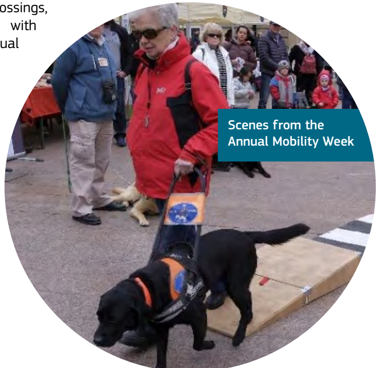
Scenes from the Annual Mobility Week

The programme includes an annual Mobility Week and Music Festival, an Inclusion Gala featuring performers with disabilities and accessible guided tours of the town and the museum.