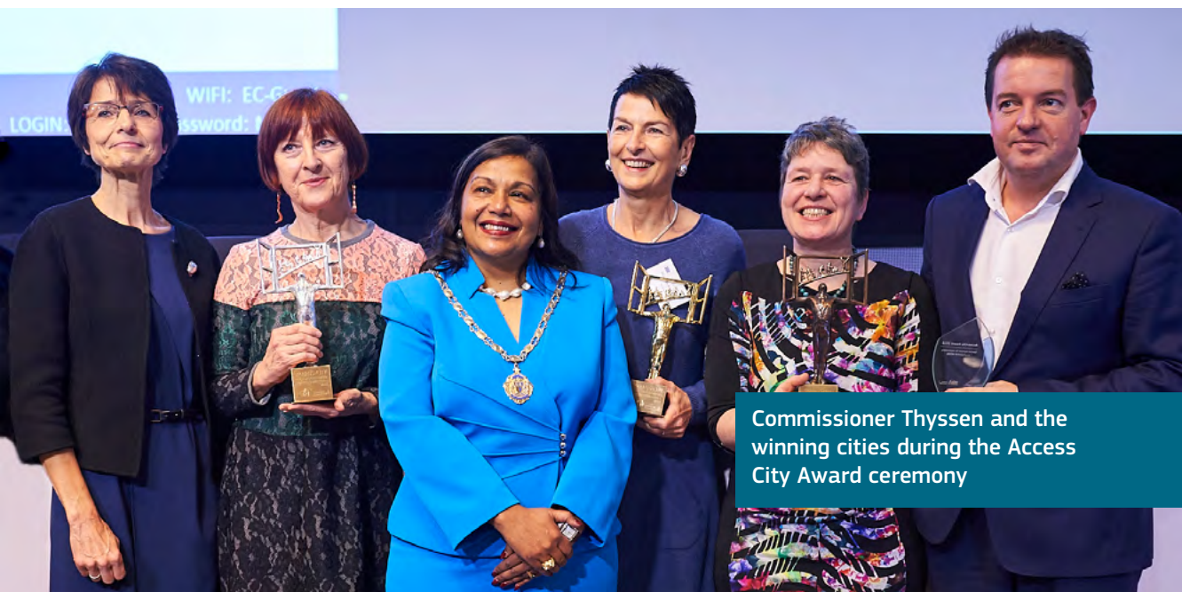
Commissioner Thyssen and the winning cities during the Access City Award ceremony

These awards highlight that improving accessibility is not always about large scale investment or major works. It can also be about understanding needs and using limited resources to best effect. Even small changes can go a long way in making sure that people can participate in urban life.