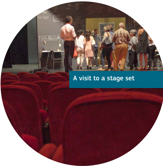
A visit to a stage set

“ I think it’s great that we are able to visit the theatre stage sets. That gives us insights into the little details of the performance. We really are VIPs.