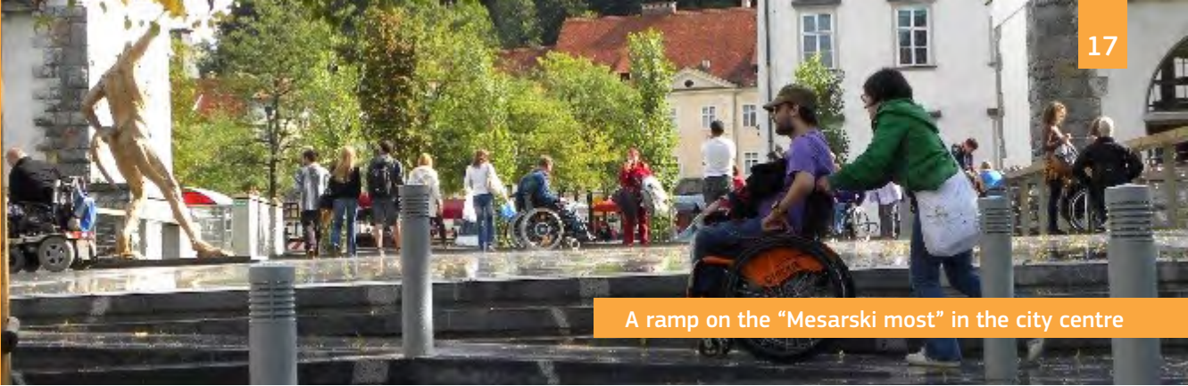
A ramp on the “Mesarski most” in the city centre